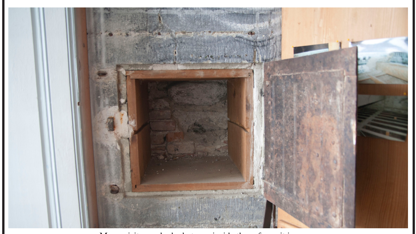
Many visitors asked what was inside the safe, so it is open.

This room, one of the most beautiful rooms of the castle after the library, contains a 1846 Pleyel piano, an Erhardt harp dating back to the 1870s and portraits of some of the people who lived in the castle. The small room behind the glass door was entirely built within the thickness of the wall (around 3 metres). Toward the other window, behind the wood panelling, we discover the Bernese bailiff's safe and part of the mural paintings which still exist behind the panelling.